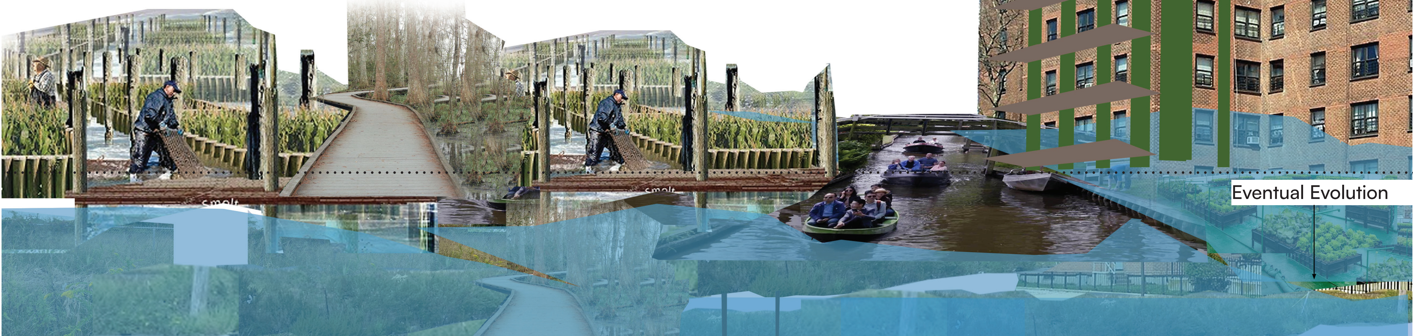
Boardwalks and floating farms towards the bay-side Houses on stilts and amphibious road networks Urban ag farms in unused and neglected spaces.