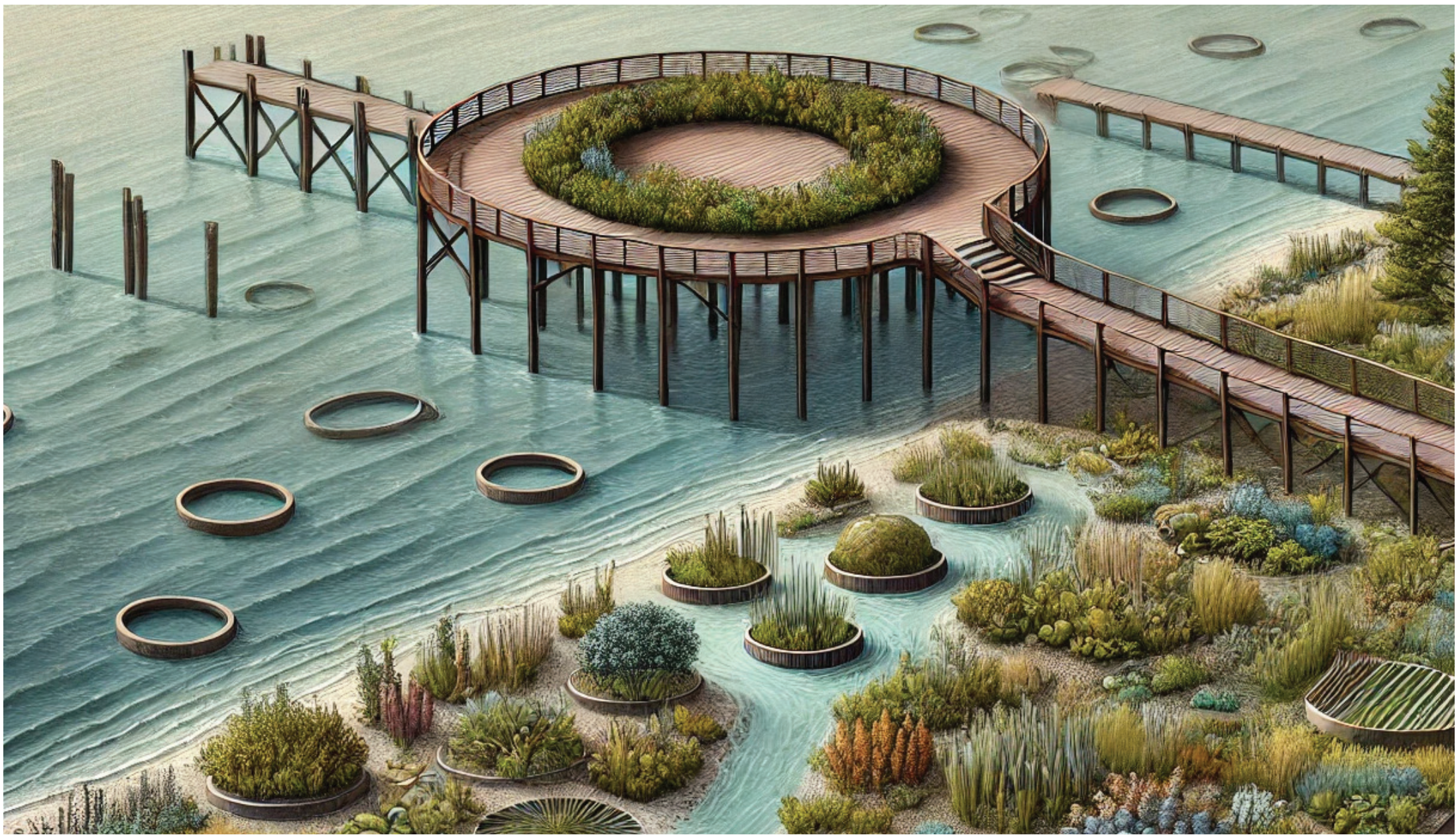
Boardwalk developments should be elevated with salt resistant plants marshes,