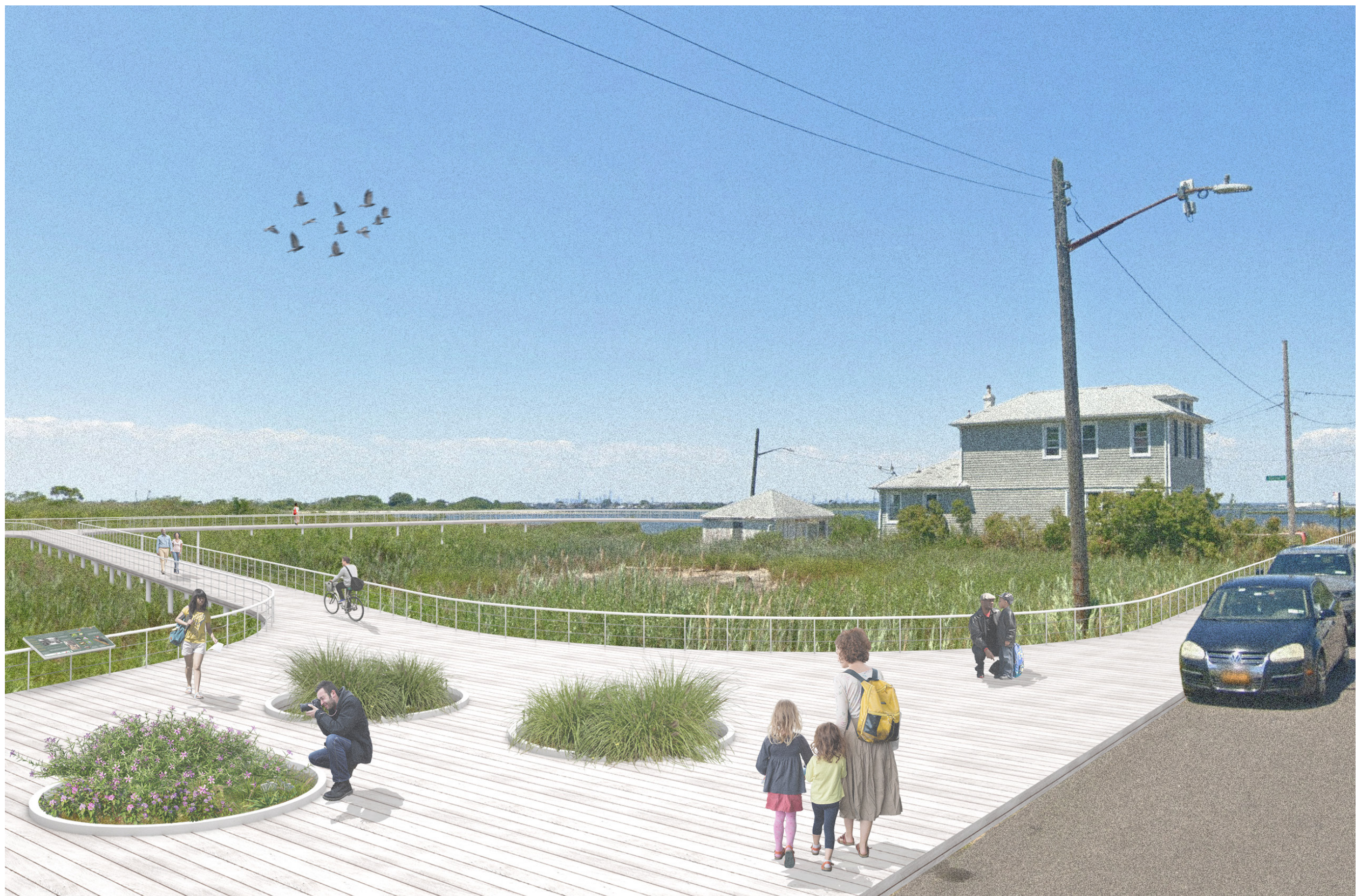
ACCESS TO PATH ALONG BEACH 72 ST