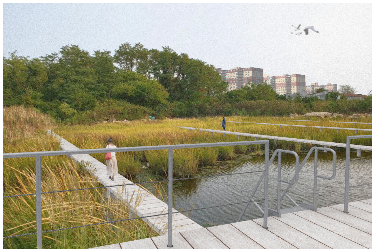
VACANT SHIPYARD TRANSFORMED INTO TIDAL MARSH PRESERVE